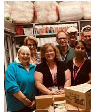
Warragul Food bank

ANTI POVERTY WEEK...OCT 12 th - 18 th . Poverty is deepening through the Covid19 times and really, it has been an epidemic all on its own, all over the world and for many years. Perhaps we can think of one thing we can do this week to stand up for those who need us to do so. Can we make a stand in some small way, for those who are rejected and stand with Jesus in making them our priority? Many of you are active in the 'Food Bank', others make donations, visit people whose poverty is a poverty of the spirit and soul, are diligent in prayer and some are active in bringing the prayer to reality. Thank you!