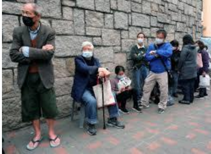
Queue for help

Warragul Uniting Church: Keeping in Touch no. 23, written on Tuesday 13 th October 2020.