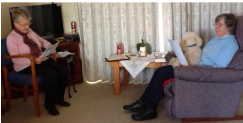
...plus a very friendly and 'interested' dog...

MEETING TOGETHER... a number of people have been meeting in small groups each week to read through the weekly Worship Service and keep in touch with each other. Others are meeting for a 'cuppa'. These are important ways to connect, maintaining and building up a sense of community. Here are some photos from one group...please note the social distancing!!!