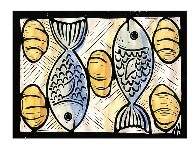
"Jesus feeds the multitude"