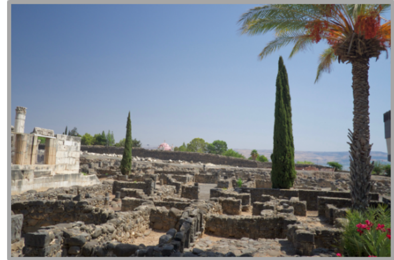
The Synagogue, Capernaum (left, overlooking Lake Galilee) "he taught in the Synagogue, and many who heard him were amazed." Mark 6:2