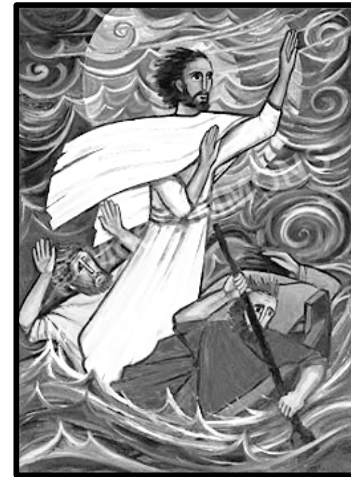
"Jesus said, Peace, be still."

And may God bless us with the foolishness to think that we can make a difference in our world, so that we will do the things others say cannot be done. Go in peace to love and serve the Lord in the name of Christ. Amen